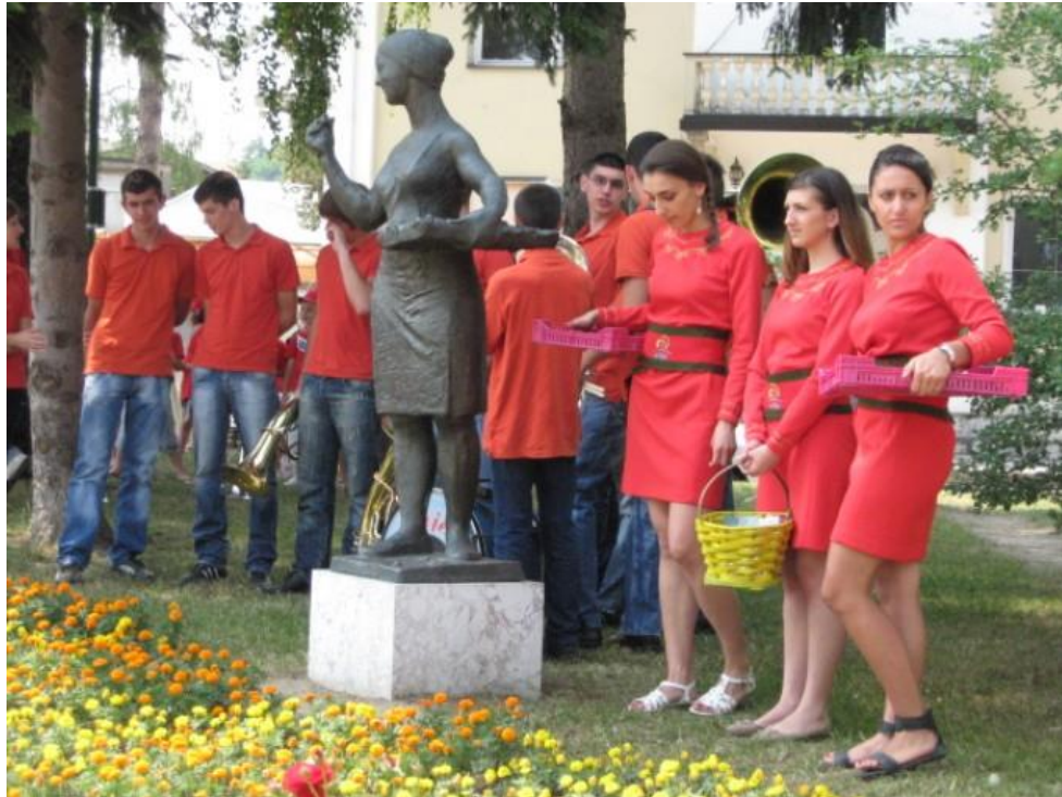
Figure 2: Raspberry Days 2012. 4

the speeches, three female promoters clad in mid-knee, raspberry-red dresses were standing next to the monument.