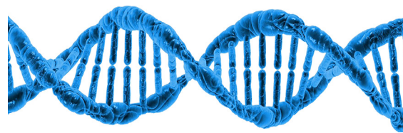
Fig. 4. Deoxyribonucleic acid (DNA) symbol with transparent background. DNA, the language of life, encodes the traits that make us unique. But tracing family lines through it requires deciphering not just biology but the vibrant cultural kinship narratives across generations.