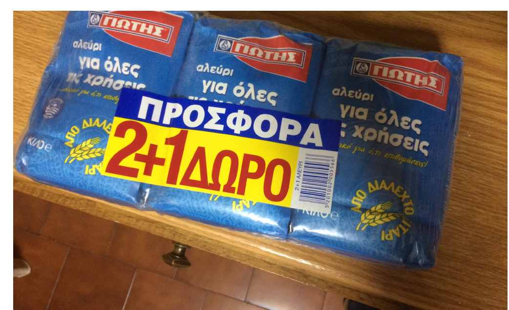
Supermarkets lower prices. Volos 2017