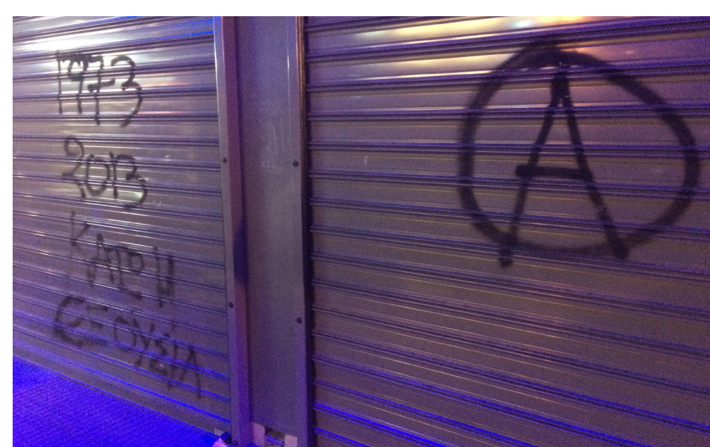
Graffiti likening the Troika to the military junta. Volos 2017