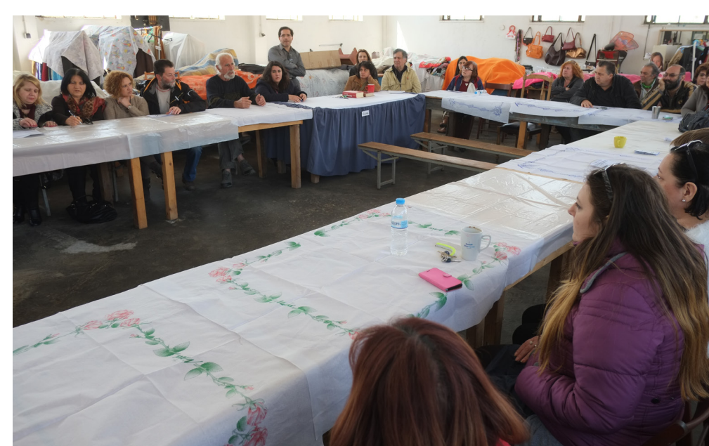
General Assembly of the TEM Currency Network. Volos 2017