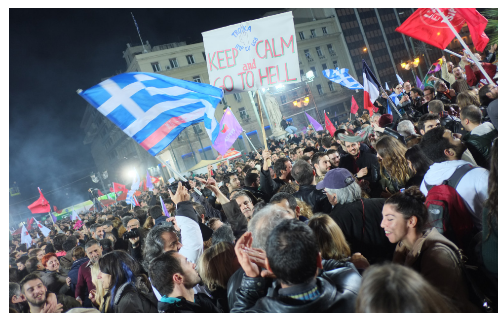
Syriza wins the elections. Athens 2015