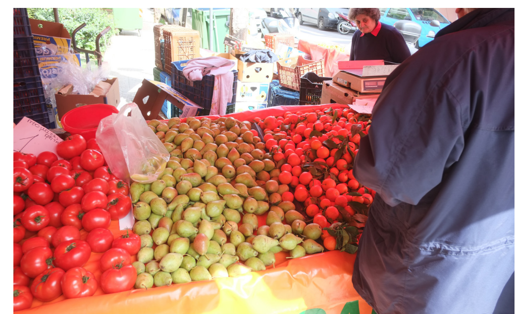
Weekly market. Volos 2016