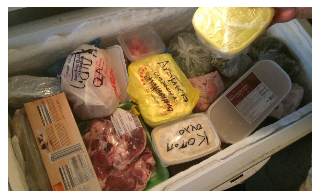
Deep freezers used to buy when goods are cheap. Volos 2017